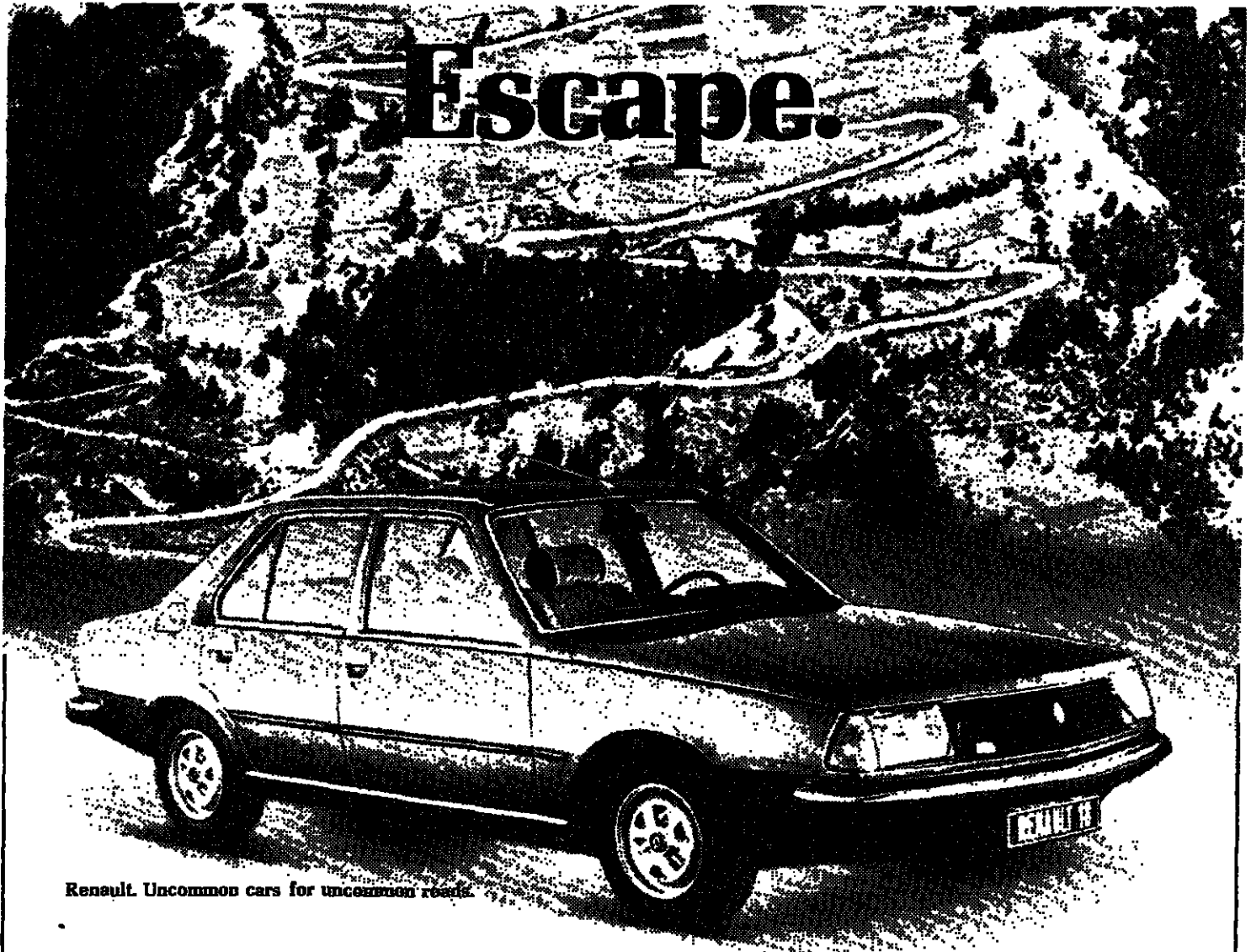
Renault. Uncommon cars for uncommon roads.

Just imagine the car of your dreams, and discover the Renault 18 reality. Taste the front wheel drive pleasure, feel the power, enjoy the equipment and love the comfort. It's air conditioned if you wish and automatic if you so prefer. Escape in a Renault 18.